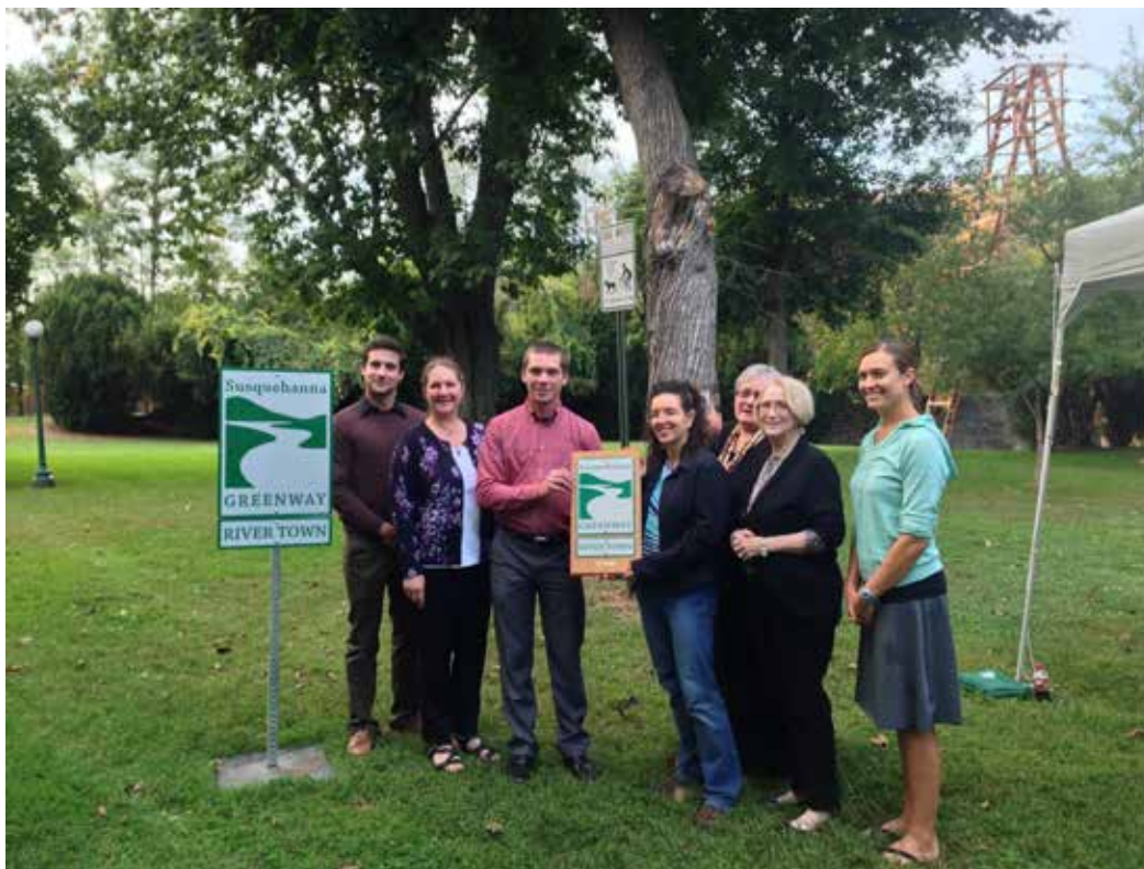
Lewisburg River Town Designation Celebration, September 25, 2014

Any addition questions about the River Towns Program should be directed to the Susquehanna Greenway Partnership, 201 Furnace Road, Lewisburg, PA 17837, or by phone at 570-522-7339.