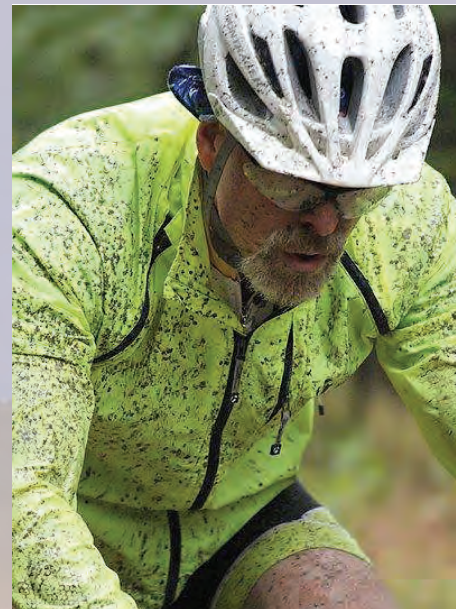
RIVER TOWN RACE

Rounding out the summer and bridging the seasons will be the downtown's 37th annual Fall Arts and Crafts Fair on September 10. Similar to its seasonal sibling, Spring Fling, it celebrates the beginning of the fall season by bringing together vendors from throughout the state, creating a bustling marketplace perfect for buyers and sellers alike. With only 106 days until Christmas, it won't be too early to think about holiday gift buying! For more information visit www.visitdanvillepa.org .