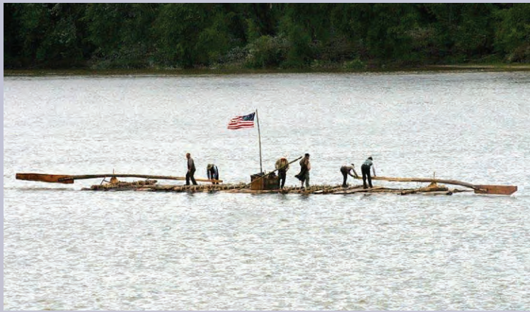
DANVILLE HERITAGE FESTIVAL