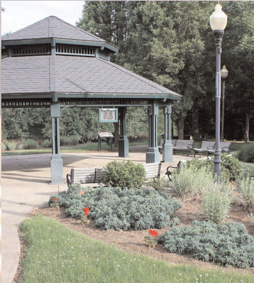
LINCOLN PARK, MILTON