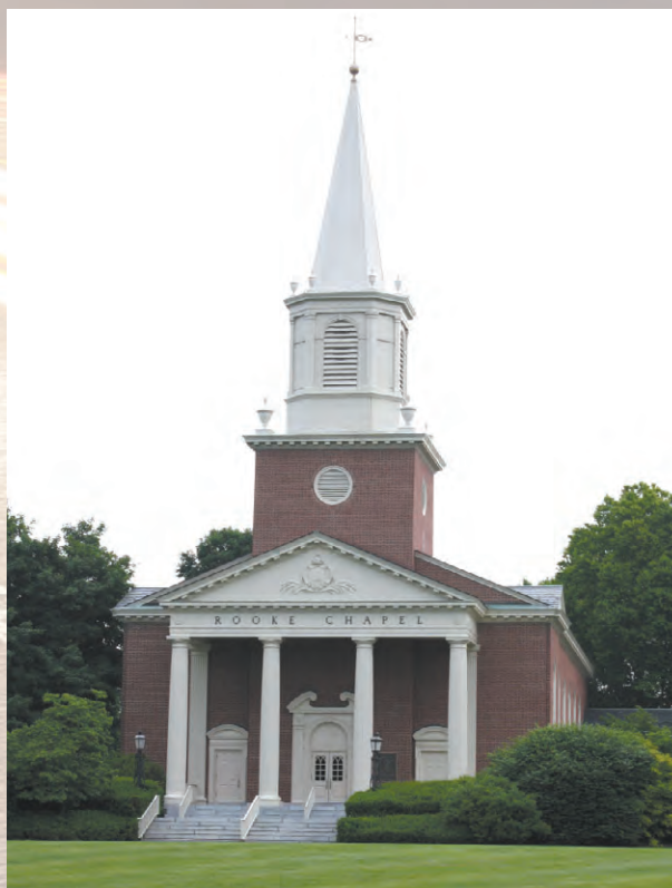
ROOKE CHAPEL, LEWISBURG

August 4 Rudy Gelnett Summer Music Series Selinsgrove - Commons • 6:30 - 8:00 PM