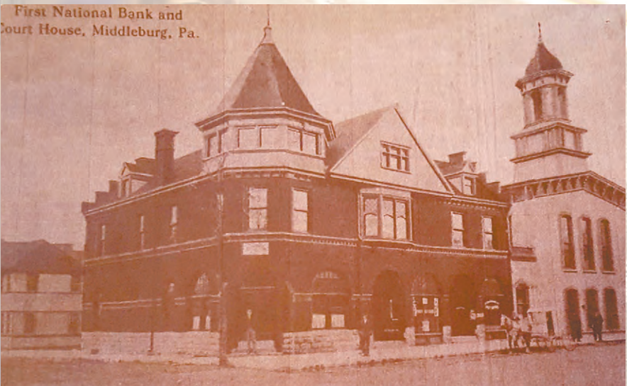
FIRST NATIONAL BANK AND COURTHOUSE, MIDDLEBURG, PA.