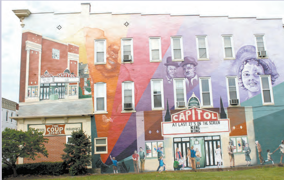
COUP MURAL, MILTON