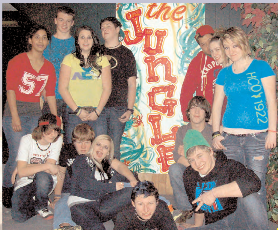
THE JUNGLE TEEN CENTER

Researchers have identified building blocks of healthy development that help teens grow up healthy, caring, and responsible. These assets fall into the categories of: