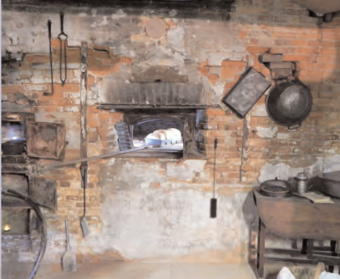
OLD MIDDLEBURG BAKERY

More events and activities are being planned, so be sure to check out our Facebook page www.fb.com/middleburgpa for all upcoming events including next year's Middleburg Heritage Festival May 13, 2017.