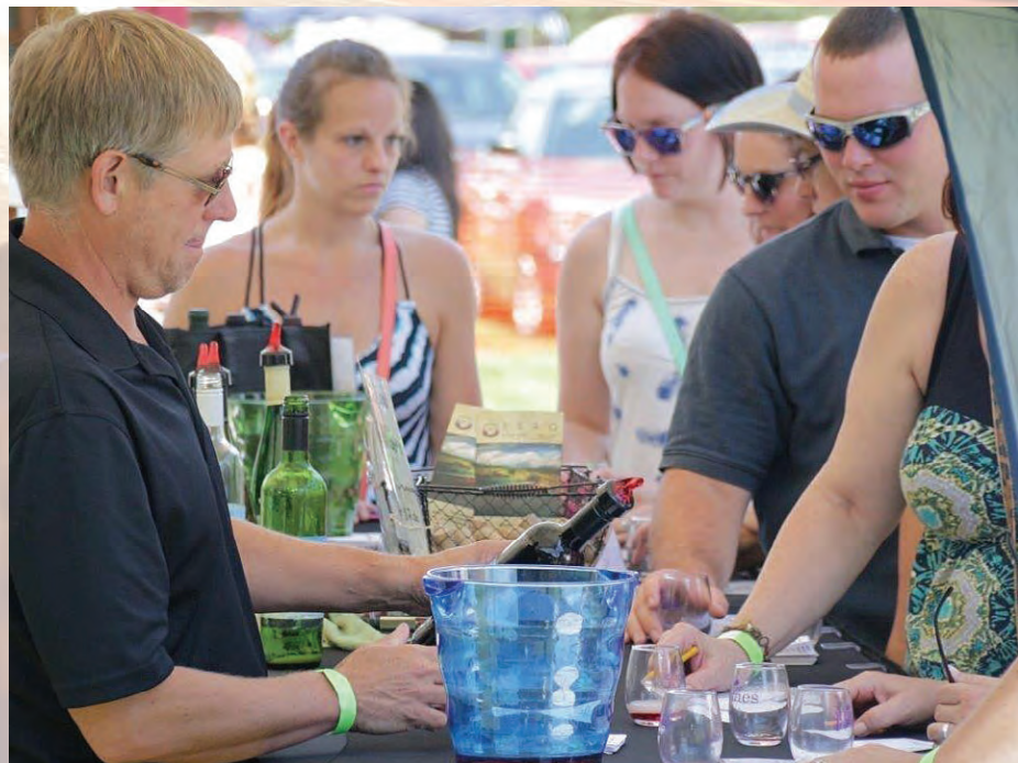
WINE IN THE PINES FESTIVAL