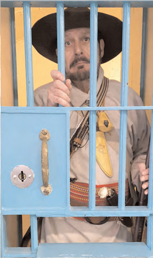
SNYDER COUNTY JAIL