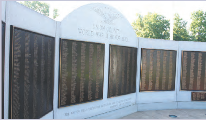
UNION COUNTY WORLD WAR II HONOR ROLL, MIFFLINBURG