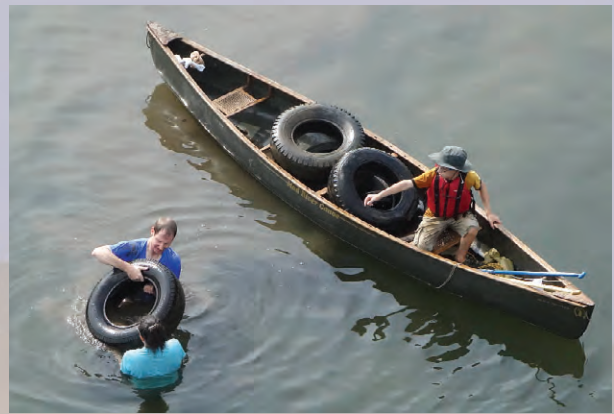
IN-RIVER CLEAN UP

The Lewisburg Neighborhoods Corporation invites everyone to help us clean up our act. There’s a lot to love and to share about our community, but litter is not on the list. For the past few years we have run various clean ups, with the major focus on our “Fall In-River Clean Up” which will take place this year on Saturday, August 27, from 9am to 3pm in Soldiers Park on Water Street in Lewisburg. (Weather and water conditions permitting.)